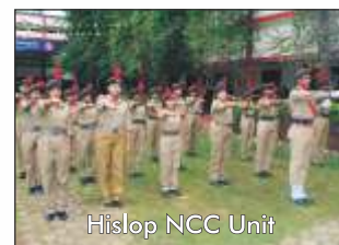
Hislop NCC Unit