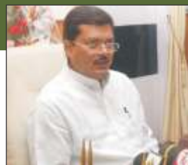
Mukul Wasnik Eminent Politician