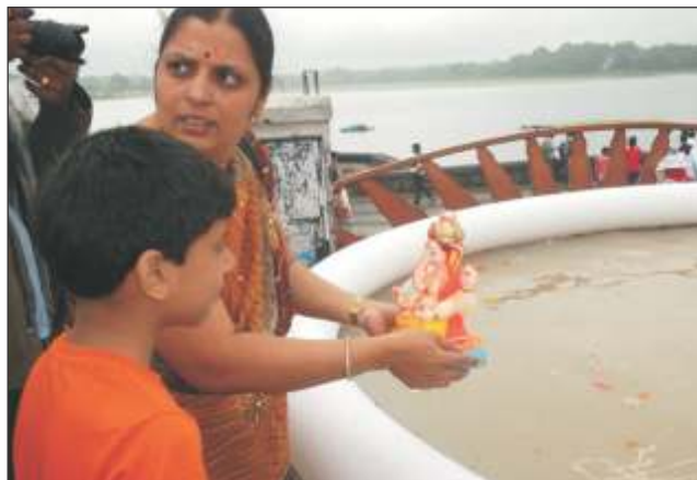
Immersion in Artificial Water Tanks.