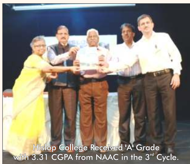
Hislop College Received 'A' Grade with 3.31 CGPA from NAAC in the 3 rd Cycle.