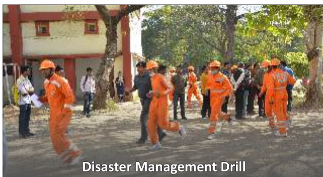
Disaster Management Drill