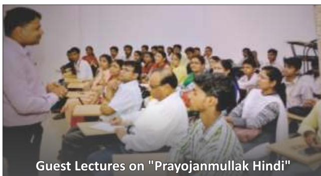
Guest Lectures on "Prayojanmullak Hindi"