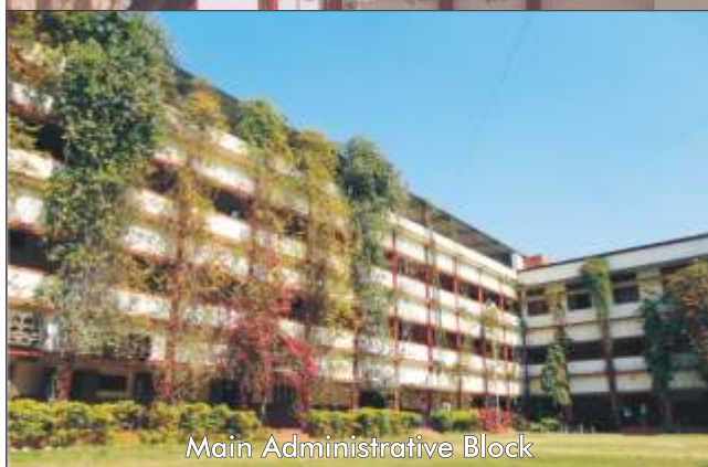
Main Administrative Block