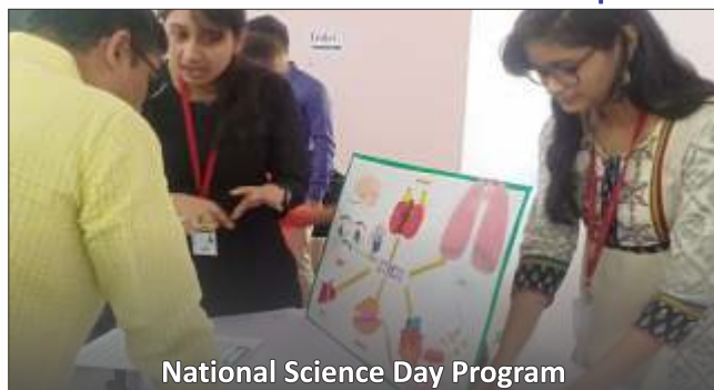
National Science Day Program