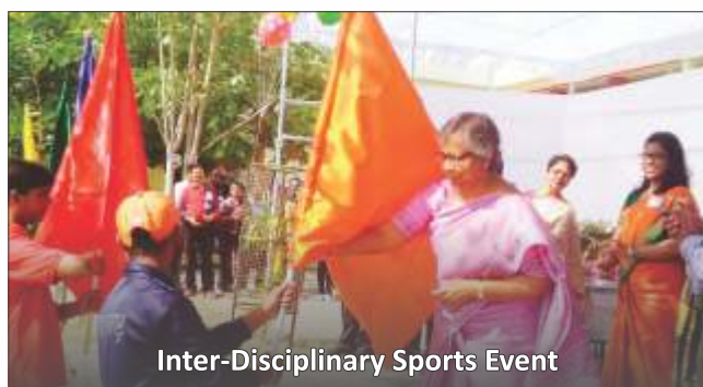
Inter-Disciplinary Sports Event