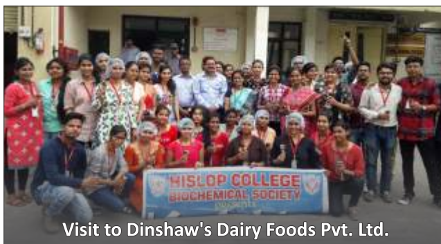
Visit to Dinshaw's Dairy Foods Pvt. Ltd.