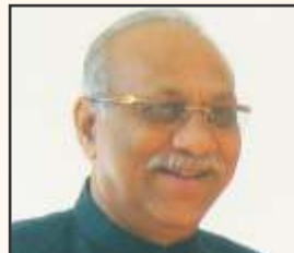
Vilas Muttemwar Former Union Minister of Alternative and Renewable Energy