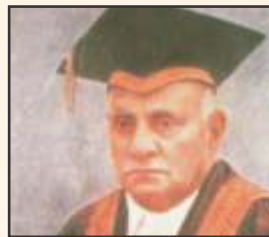
Sir Hari Singh Gour Member of the committee that made Indian constitution, founder of Sagar Univ.