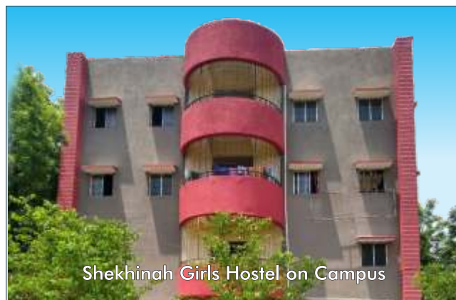
Shekhinah Girls Hostel on Campus