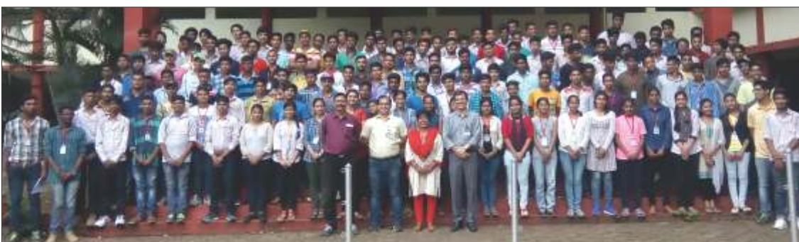
Players Orientation Camp