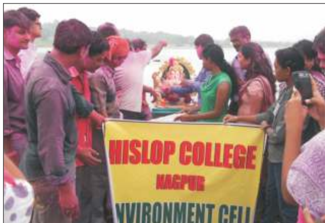
Nirmalya Collection from devotees