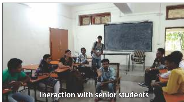
Interaction with senior students