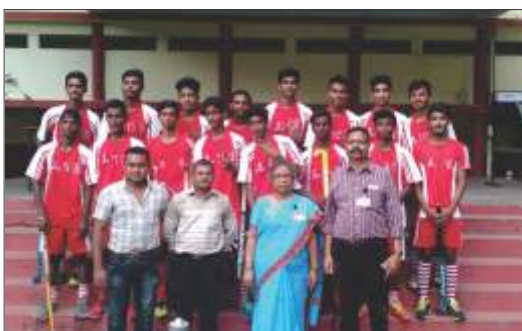
Winner Hockey Team in District & Division Tournament & Participated at State Tournament