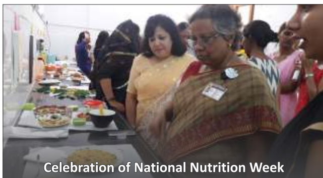
Celebration of National Nutrition Week