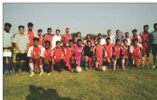
Winner Football Team: 19 th Rev Stephen Hislop Memorial Football Tournament & UDGHOSH Football Tournament 2016-17