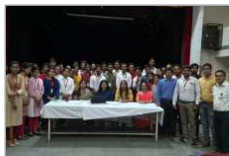
Group of Students Placed in ICICI Prudential