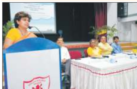
Knowledge Skill Workshop by NIIT