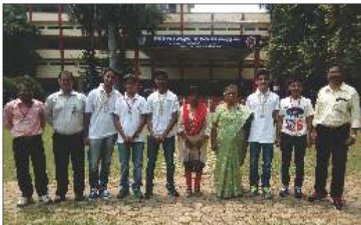
Runners-up Trophy in State Tournament Hislop College Boys Badminton team