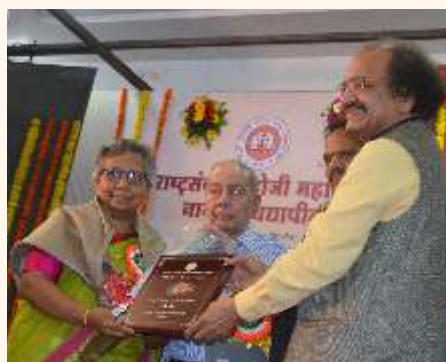
'Ideal Institution Award'