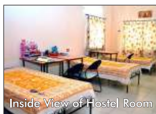
Inside View of Hostel Room