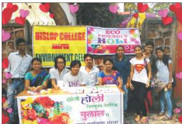
Eco-Friendly Holi in Hislop College Campus