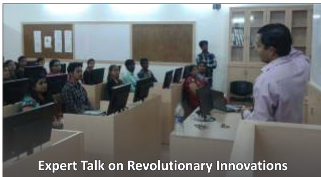
Expert Talk on Revolutionary Innovations