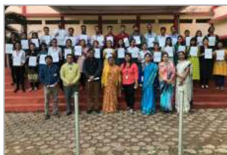
Group of Students Placed in Concentrix

120 students were placed in the session 2015-2016