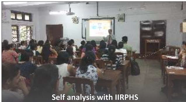
Self analysis with IIRPHS