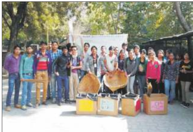
"Swachh Hislop Campus"