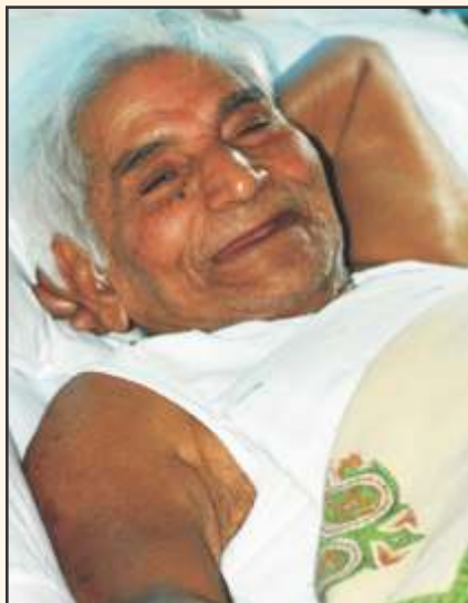
Baba Amte Renowned Social Activist, Raman Magsasay Award Winner