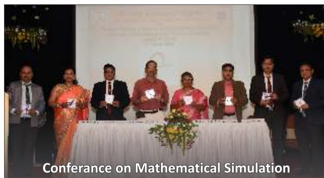
Conference on Mathematical Simulation