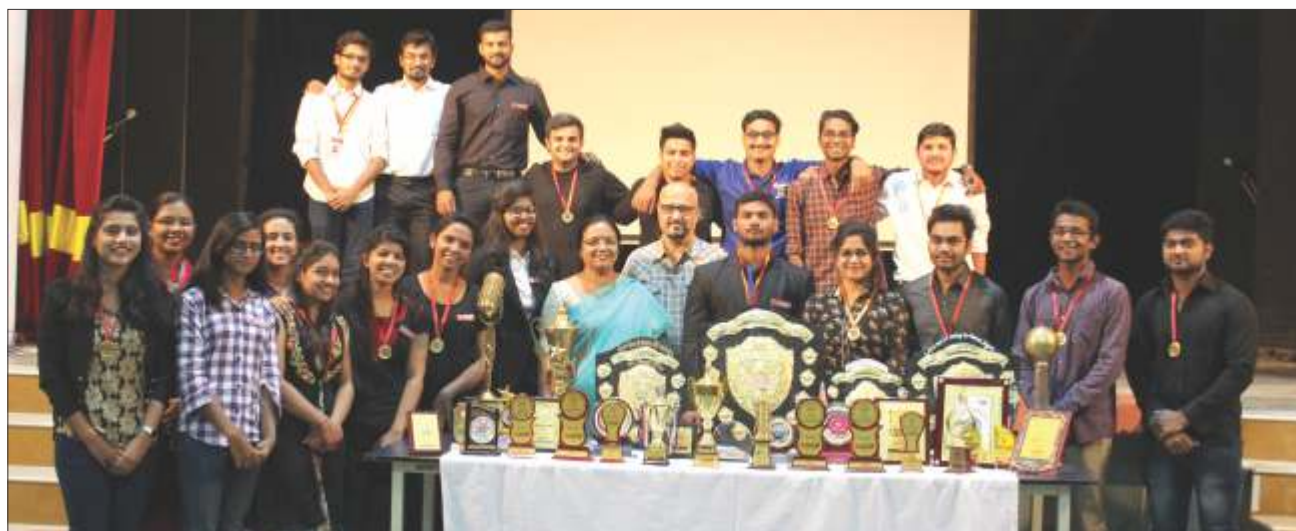
Hislop College wins 29 Trophies and Prizes in Intercollegiate Debate, Elocution Competitions