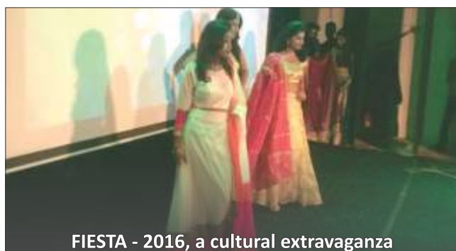
FIESTA - 2016, a cultural extravaganza