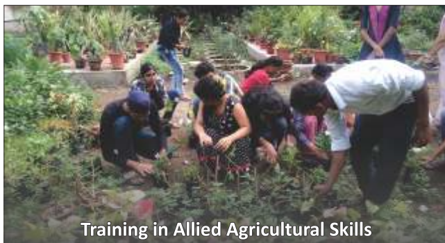
Training in Allied Agricultural Skills