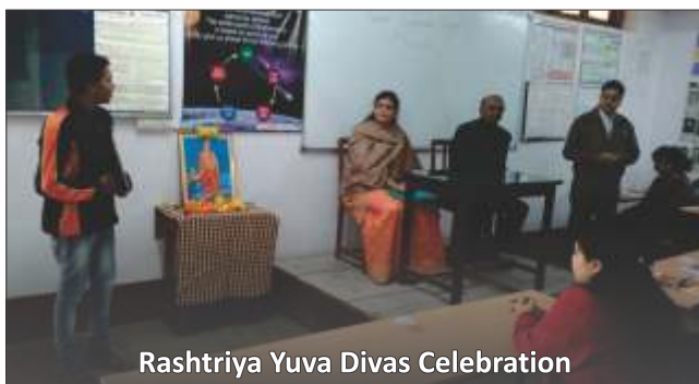
Rashtriya Yuva Divas Celebration