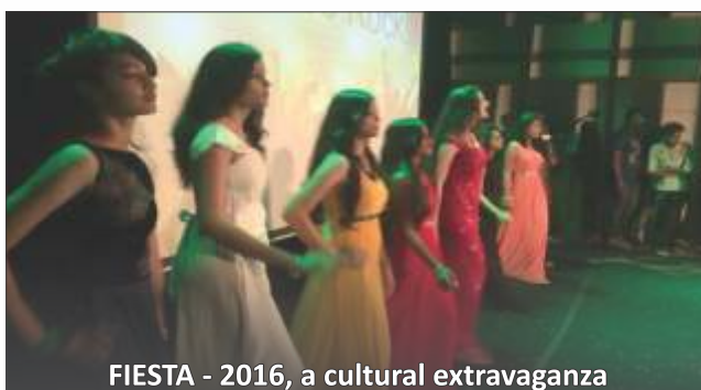
FIESTA - 2016, a cultural extravaganza