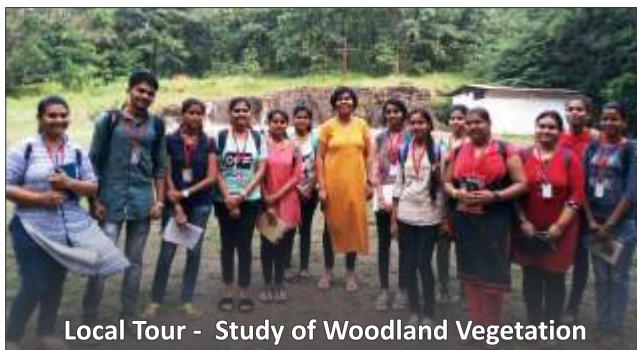
Local Tour - Study of Woodland Vegetation