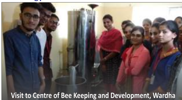
Visit to Centre of Bee Keeping and Development, Wardha