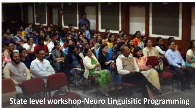
State level workshop-Neuro Linguistic Programming