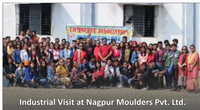
Industrial Visit at Nagpur Moulders Pvt. Ltd.