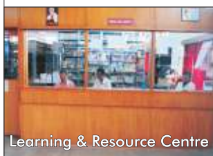
Learning & Resource Centre