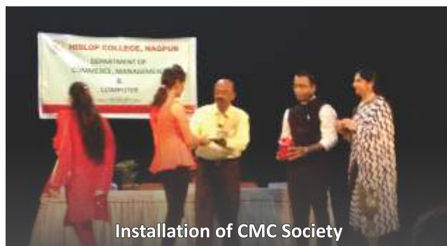
Installation of CMC Society