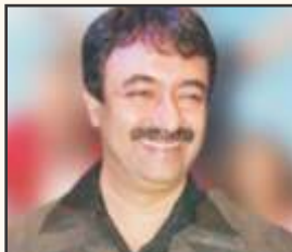
Rajkumar Hirani Award winning Film Maker, Writer and Producer