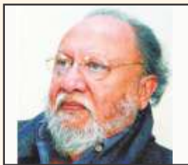
Prof. Ashis Nandy World renowned social psychologist, a former professor of Harvard University