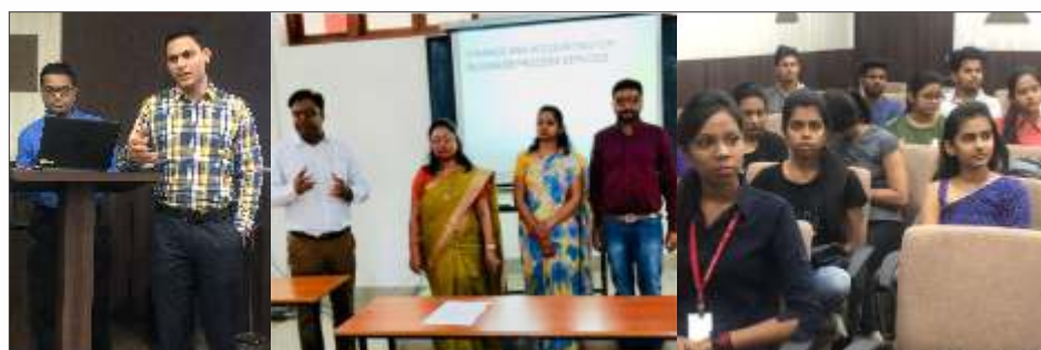
TCS Certified Course on Finance & Accounting for BPS