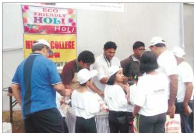
Awareness of Eco-friendly Holi at Rotary Walkthon Event