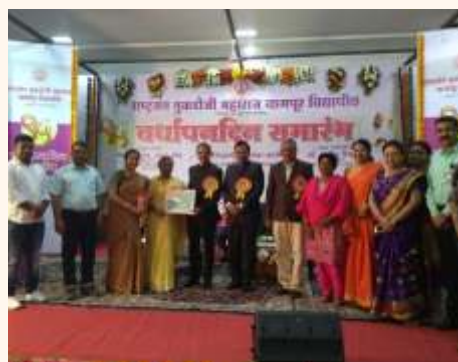
1st Prize for the College Magazine The Hisloppian