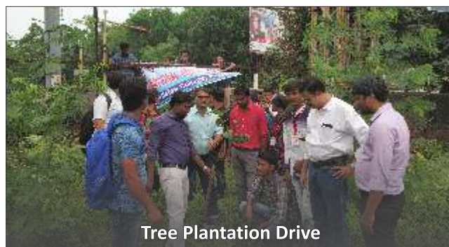
Tree Plantation Drive