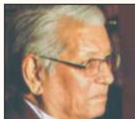
Shantaram Potdukhe Former Union Minister of Finance