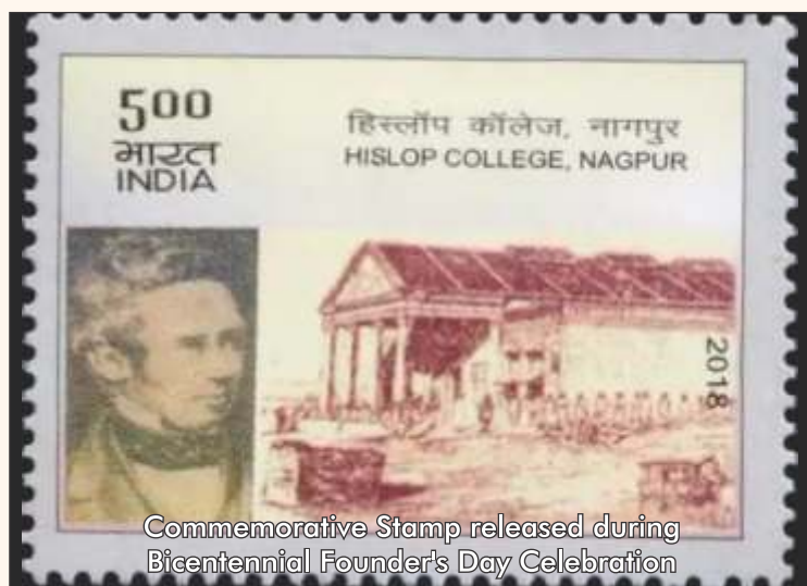
Commemorative Stamp released during Bicentennial Founder's Day Celebration