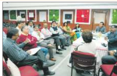
Conclave Vision 2020