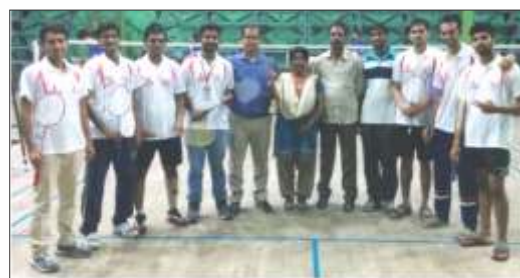
Winner Team: RTM Nagpur University Inter College Badminton Tournament