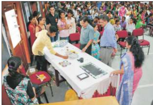
'Best out of E-waste'