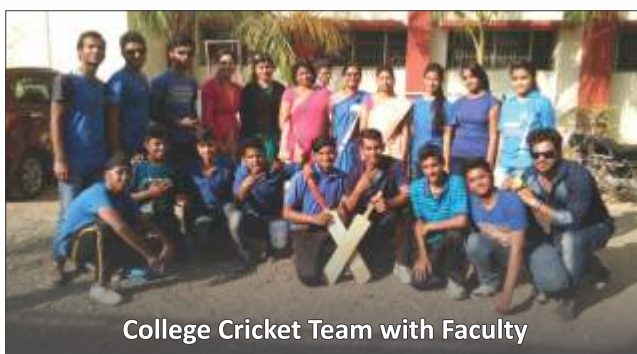
College Cricket Team with Faculty